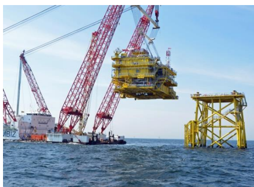
Figure 5. A floating crane lifting a transformer. 9

At the transformer station, the power from the individual wind farms is collected and upscaled for further transmission (see fig. 5).