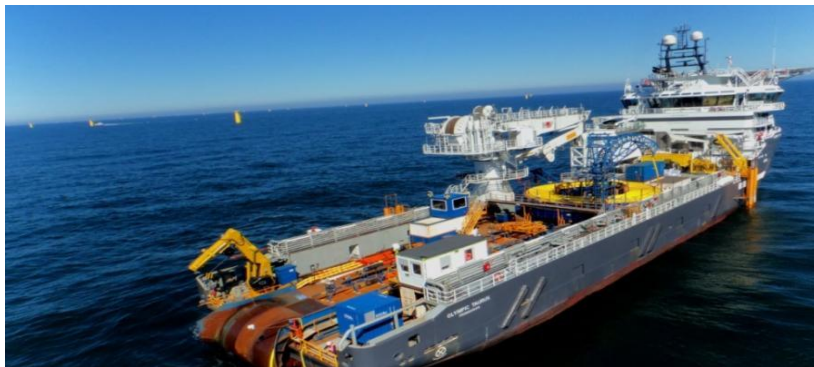
Figure 2: A cable-laying vessel. 4

The market for subsea cables is dominated by a few multinational corporations. Manufacturing subsea cables requires highly specialized facilities. For example, export cables must be very long to minimize the number of required joints. The production of such long cables requires special production technology, such as vertical continuous vulcanization (VCV) and catenary continuous vulcanization (CCV) lines. These permit a continuous vulcanization process that helps to properly insulate the core of the subsea cables. 3