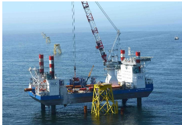
Figure 3: A jack-up barge installing jackets. 6

Various foundations can be used for OWFs. The most common types are monopiles, jackets, and tripods. The choice of foundation design for offshore wind substations depends on the water depth and the load carried. Jacket foundations are generally favored because transformers and converters carry extremely heavy loads (see fig. 3).