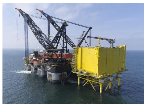
Figure 4: A floating crane lifting a converter. 7

The converter station converts the electricity generated by OWFs from AC to high-voltage direct current (HVDC). The electricity is then transmitted to a land-based converter station, where it is converted back to AC and fed into the grid. Seven converter stations have been built to date and two are under construction.